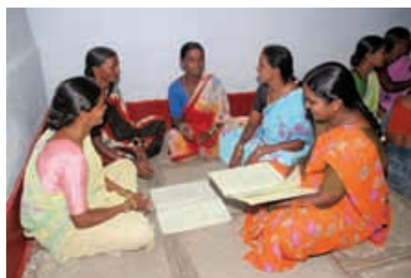
Self-help groups are supported